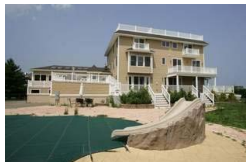
A $2 million dollar, 7-bedroom house with a private beach at 90 Ocean Ave. in Monmouth Beach. With luxury home prices falling, buyers are looking for deals on such waterfront properties at the Shore.

It seems like $2 million is the magic number for a seven-bedroom home on Ocean Avenue in Monmouth Beach.